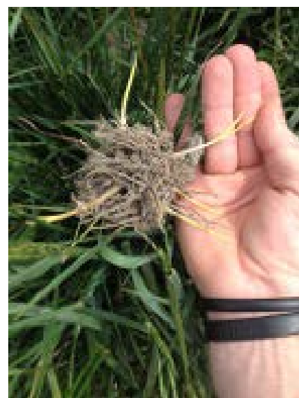
RTF plant exhibiting rhizome expression