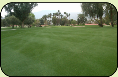
Top Gun II on courses in Dubai (top) and Palm Springs, California (left)